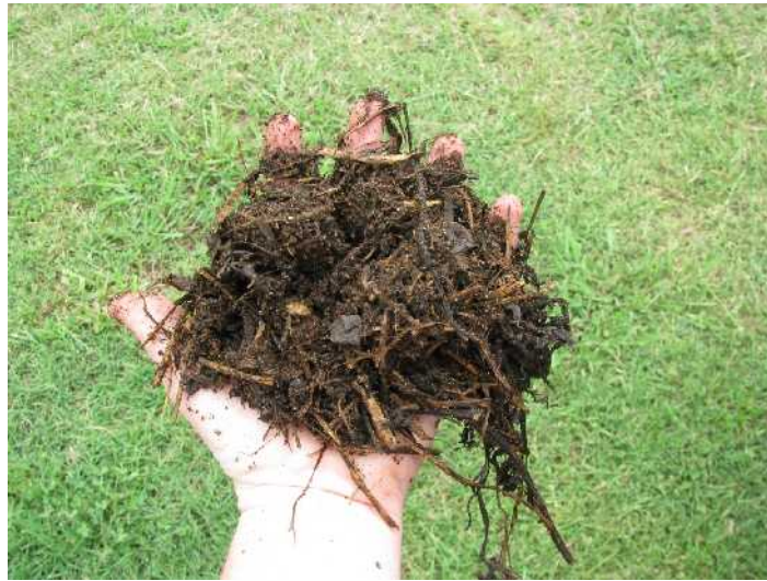
This is what 14-day old compost looks like if the recipe is correct.

the pile had already transformed into a compost-looking substance. This recipe for fast turnaround compost has worked the best. I believe that is because of the trial and error element, I have learned what to do and what not to do in making compost piles.